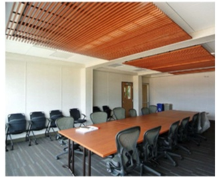
OFFICE & ADMINISTRATIVE AREAS