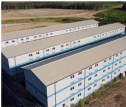
324 BEDROOMS IN 3 3-STORY BUILDINGS