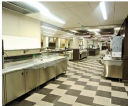
FULL-SERVICE KITCHEN & DINING AREAS